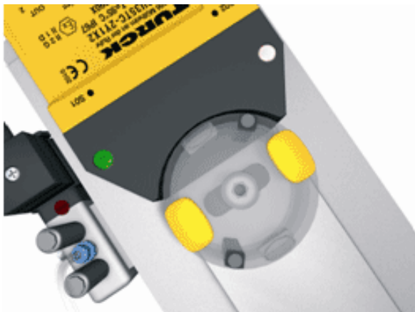
[Figure1 “Closed” position]

This can be simply avoided using the standard TURCK puck BTS-DSU35-EB1. A well thought-out solution with 2 actuation pins in the puck, provides a problem-free application for clockwise and anticlockwise turning drives, without having to modify the puck. [Figures 1 & 2] The puck also solves another problem. If for example, the drives have to be fitted “transversely” due to space restrictions, the usual optical position displays are no longer correct. This leads to confusion and makes trouble-shooting more difficult. Here too the standard puck BTS-DSU35-EB1 offers a solution where the position displays are clearly visible from all sides, and where they can be rotated by 90° without the need for tools.