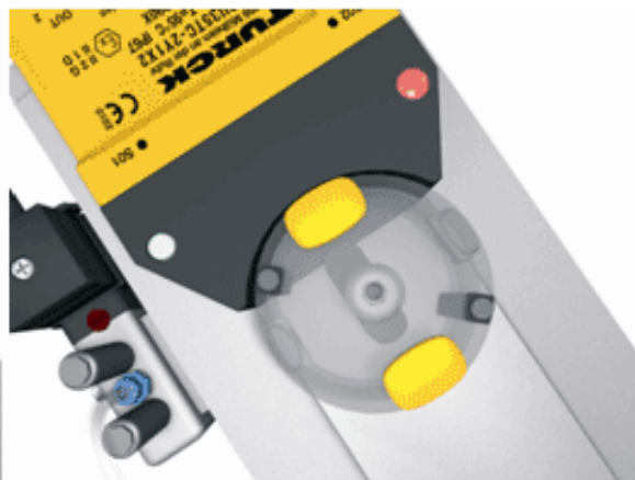
[Figure2 “Open” position]