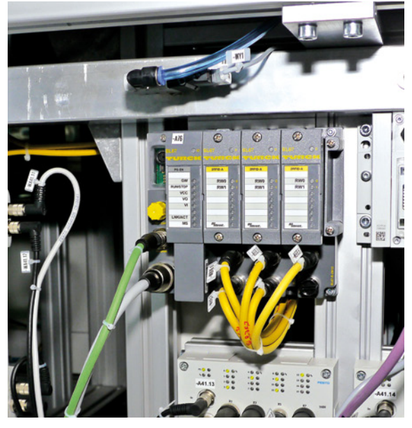
The data of the read/write heads reaches the database using Turck's BL67 gateway with RFID modules