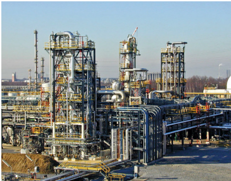
CPChem plant in Beringen, Belgium

Anyone who avidly follows the technology and IT press would have already read the swansongs to the smart-phone that went around a few years ago. Even well-respected CEOs from Silicon Valley have recently predicted that its time had come. Data glasses, smart-watches and digital assistants, such as Amazon's Echo as well as similar devices are often mentioned as successors. Technology migration makes space for new innovations – one characteristic that the consumer and industrial B2B business have in common. When existing device types are discontinued or become unnecessary, their function, i.e. what they performed for a plant or machine, has to be taken over by a different device.