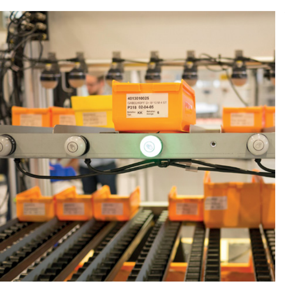
The put-to-light system indicates the row in which the newly filled container has to be inserted