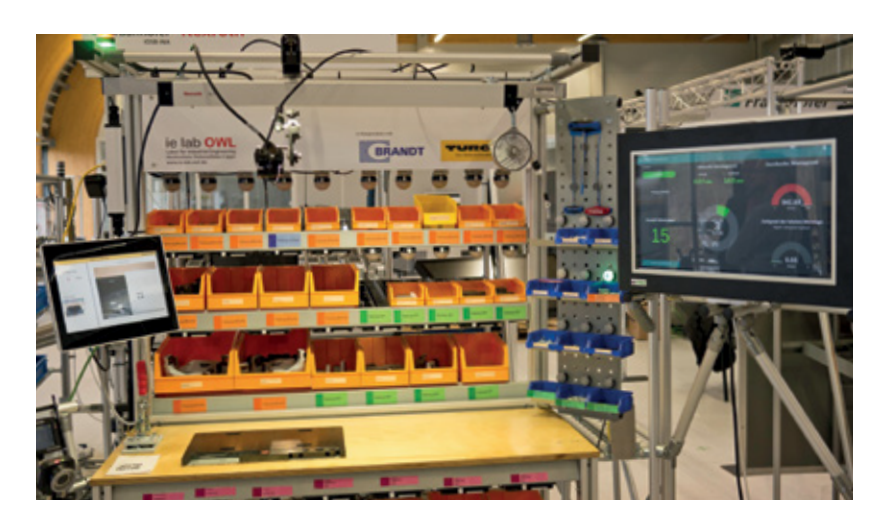
Continuous further development: The key indicator cockpit (right) was recently added to Turck's pick-to-light system