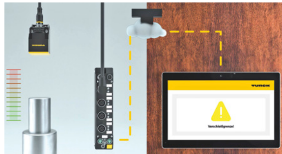
The inductive sensor signals whether its target has deviated from the specified switching distance – thus indicating possible wear