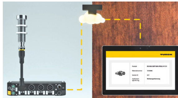
The cloud independently uses information from the intelligent IO-Link device in order to identify a sensor

A measuring ultrasonic sensor also supplies data on signal quality in addition to the distance value. This gives users the possibility to not only query a level value, but also to receive an alarm, for example, if there is a buildup of foam on the surface of the liquid, which