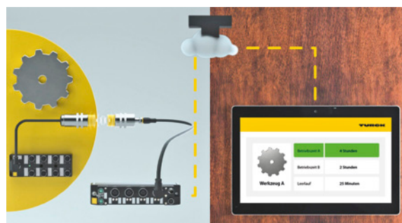
Users can conveniently see in the cloud dashboard the operating hours of each individual tool