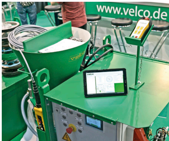
Turck Cloud Solutions enable Velco to provide effective support today for its customers and reduce costs for service callouts worldwide

Added value number five: Relevant process parameters can also be recorded by means of additional information in the cloud. If different tools are used in a machine, operators have to take their specified lifetime into account where possible. The process parameters of each tool can be transferred to the cloud so that this data can be used or stored. This is made possible, for example, with Turck's inductive coupler. After a tool change, the tool and the cloud carry out a contactless exchange of the values, such as the operating time between each other. Users can then view in the cloud the number of hours in which the individual tools were used or the particular downtime of a machine.