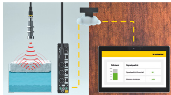
The ultrasonic sensor also indicates the buildup of foam on the surface as well as supplying the level value