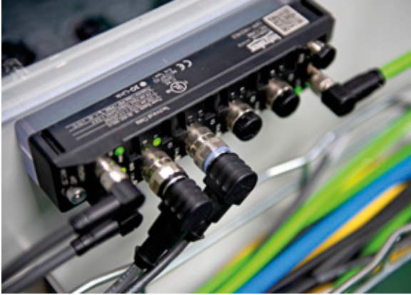
ISC CAM: The decentralized Intralox logic on Turck's robust TBEN-S block modules enables a variable conveyor layout without complex control cabinet installation

Turck's large portfolio of IP67 I/O modules ensures a seamless, decentralized approach for modular machines and plants