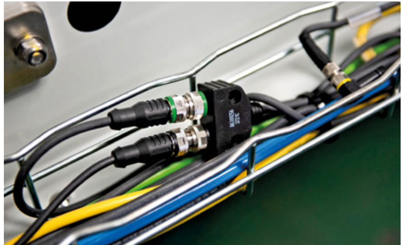
Fast and trouble-free cabling is promised by the M12 connectors with color-coded rings for poka-yoke connections

The loops HMI does not have the typical screen on the cabinet. "There is no need for a physical HMI because the loop can be controlled, adjusted and changed thru a 'virtual HMI' that is hosted in the web-server of the ISC. This is easily accessible with a laptop or any device with a web-browser", says Lazlo Kleczewski. The automation of the motors and safety systems in the loop is done decentralized by a combination of field controllers from the Turck TBEN product line. Thanks to the large portfolio of IP67 I/O components for serial and Ethernet communication the demo loop's cabinet is not bigger than a shoebox. It only incorporates some