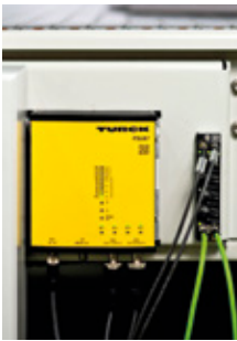
Fast cabling, easy installation: The robust PSU67 power supply provides all required voltages directly on site