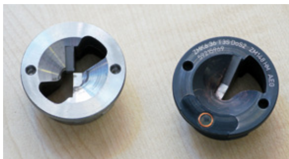
The integrated compact tag could be well protected in the cutting head (right)