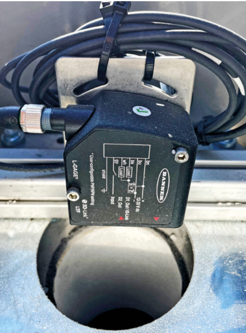
The robust LTF12 laser sensor with an IO-Link output has a range of up to 12 meter with a resolution of 0.3 to 3 millimeter

Adfil's smart level detection system from Turck, which optimizes procurement and production at the same time, demonstrates how sensor-2-cloud solutions don't have to be expensive and complex